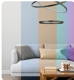
ALWAYS THE RIGHT MOOD

GUIDED BY THE LIGHT: Become more in tune with your circadian rhythm by creating custom light routines that ensure you feel sleepy in the evening and alert in the morning.