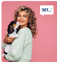
SAY THE MAGIC WORD