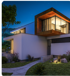
AT HOME OR FAR AWAY