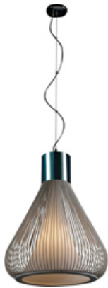
E21501-09WT Hydrox 1-Light Pendant