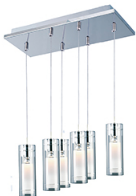
E22002-10 Frost 6-Light Pendant