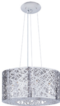
E21309-10PC Inca 7-Light Pendant