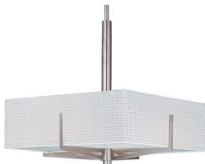
E95345-100SN Elements 3-Light Pendant